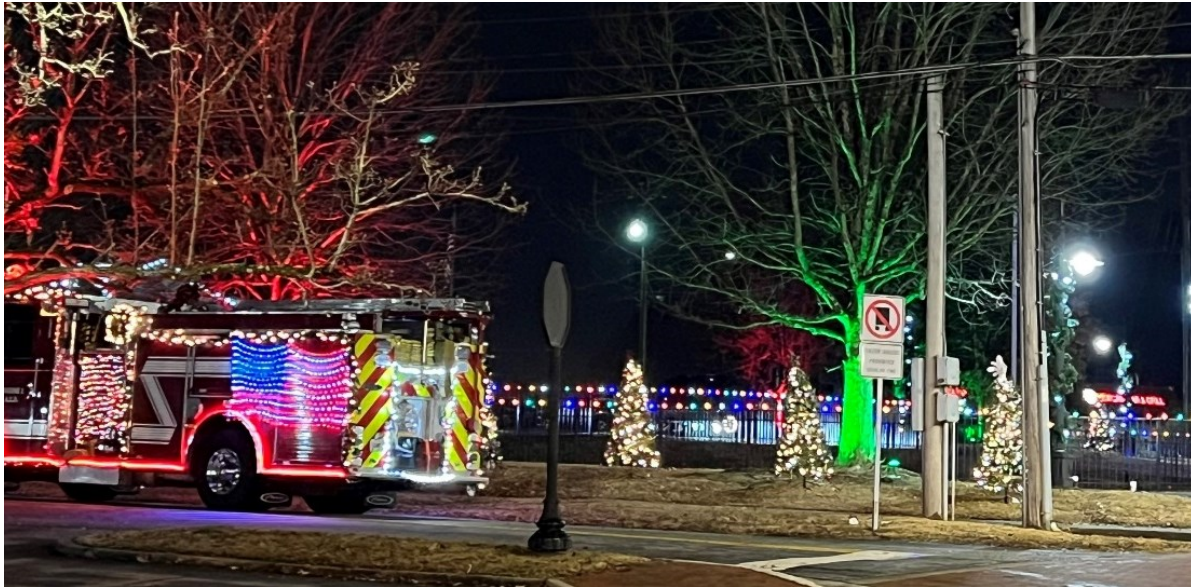
December 3, 2022 - Sweetwater Mission hosted the Austell Holiday Festival featuring the Electric Parade, Lighting the tree and Santa. There was lots food, great music and a huge monitor so that we could watch the SEC Championship game. Great fun for the whole family!