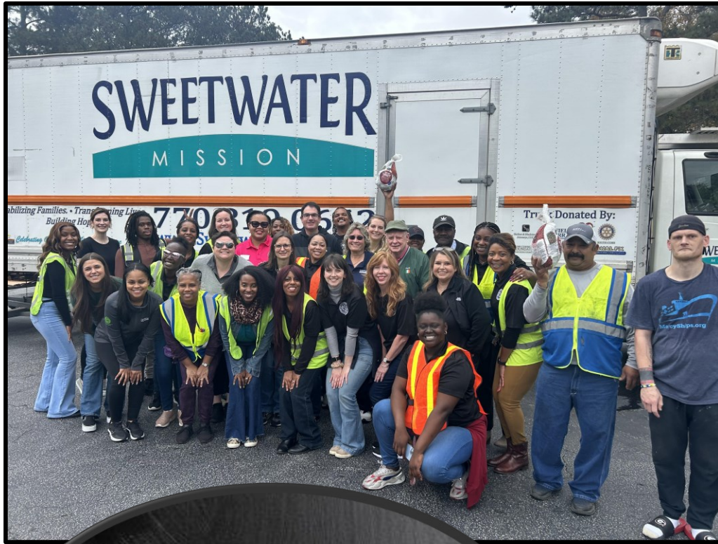
All of the staff and volunteers