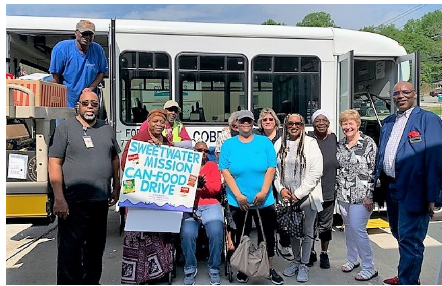
Austell Seniors sponsor a can drive every year to help SWM