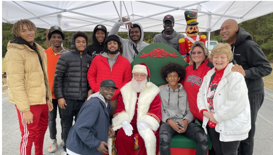
Sweetwater Mission appreciates our family members in the community